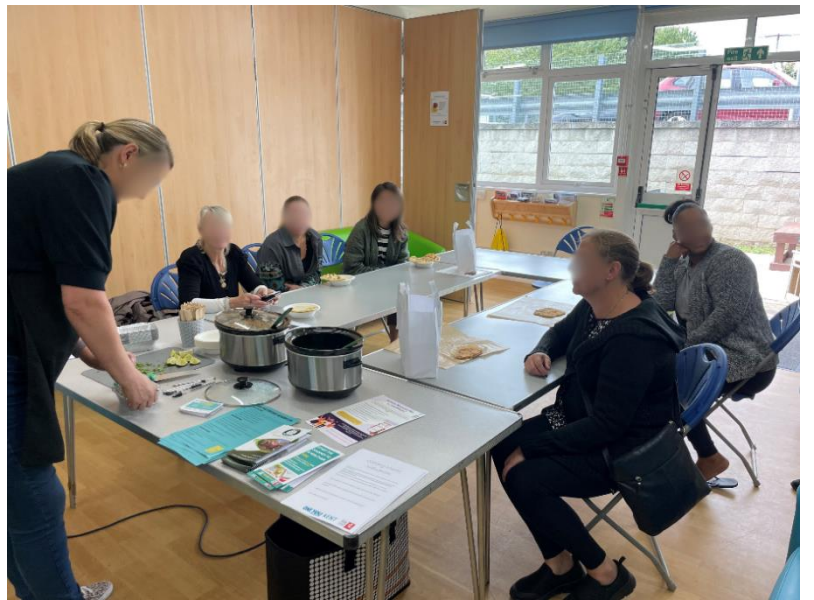
Figure 4 – One of the many Slow cooker courses offered.