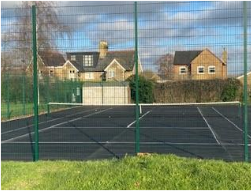
Figure 3 – Resurfacing and Upgraded Tennis courts in West Malling.